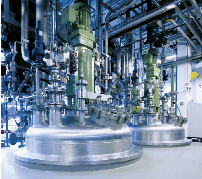
Chemical production facility at Siegfried in Zofingen

measuring the utility tunnel himself and creating a 3D model of it. To that, he says, shrugging his shoulders with a smile, “Other people have hobbies, right?”